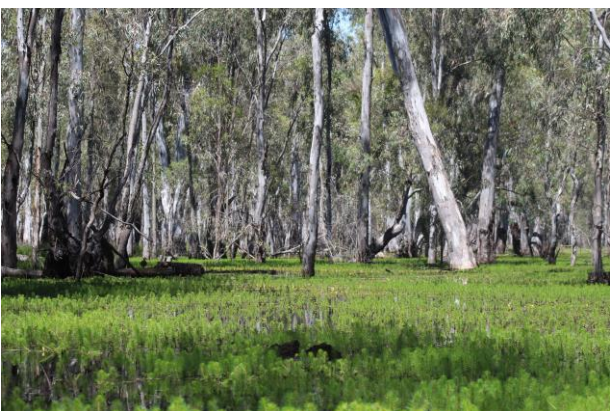
Floodplain surrounding the Little Reedy Complex will be watered in spring 2021

Much of the flood-dependent vegetation in the Gunbower Forest has not been inundated since 2018, stretching the tolerances of these vegetation types to dry conditions. Deliveries in spring 2021 will aim to inundate some of the low-lying areas of flood dependent vegetation in the lower Gunbower Forest.