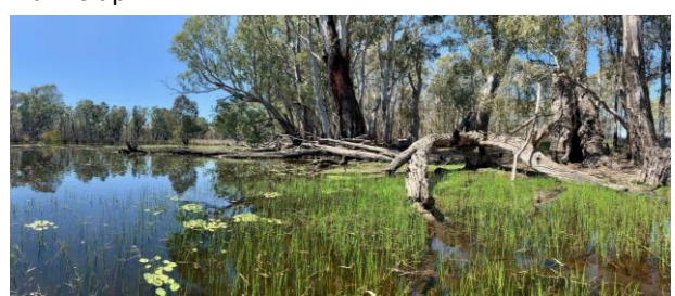
Reedy Lagoon will be a haven for nature lovers How will the watering impact forest users?

Reedy Lagoon is always a special place to visit. It's a great spot for waterbird watching, photography and has excellent aquatic vegetation. Yarran Creek and Little Gunbower Creek will be great options for kayaking, and the Gunbower floodplain will be at its best in late spring and makes a perfect place to explore when the weather warms up.