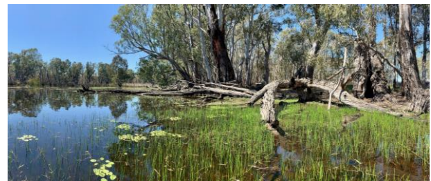
Reedy Lagoon will be a haven for nature lovers

Reedy Lagoon is always a special place to visit. It's a great spot for waterbird watching, photography and has excellent aquatic vegetation. Yarran Creek and Little Gunbower Creek will be great options for kayaking, and the Gunbower floodplain will be at its best in late spring and makes a perfect place to explore when the weather warms up.