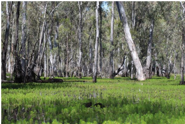
Floodplain surrounding the Little Reedy Complex will be watered in spring 2021

Much of the flood-dependent vegetation in the Gunbower Forest has not been inundated since 2018, stretching the tolerances of these vegetation types to dry conditions. Deliveries in spring 2021 will aim to inundate some of the low-lying areas of flood dependent vegetation in the lower Gunbower Forest.