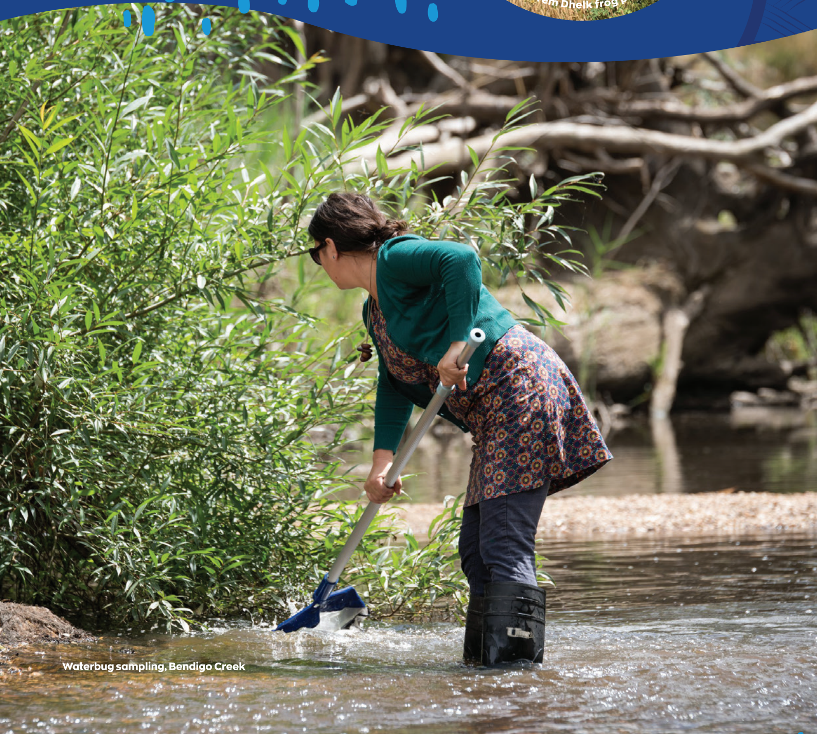
Waterbug sampling, Bendigo Creek