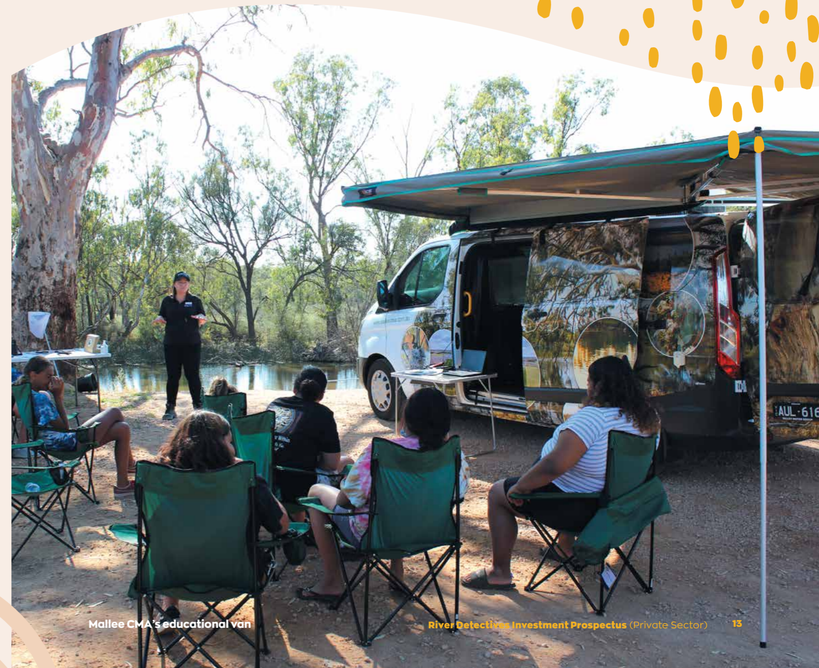
Mallee CMA's educational van

It is envisaged that having an educational van or trailer would have multiple uses. It would be in high demand across the organisation for attendance at many field days and community events to raise awareness of catchment health more broadly. It would also be a travelling billboard, promoting River Detectives and your organisation as it travels across Victoria.