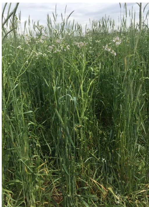
Cover crop grown by Raywood group member

The groups will be active in their communities so keep an eye out for upcoming events or alternatively you can contact the facilitators directly where they will include you on their email list. Danny can be contacted on facilitator@lpln.org mobile 0490 412 430 and Andrew on bnglandcare@gmail.com mobile 0407 856 227