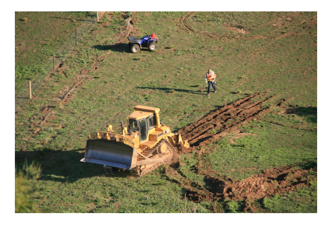
Ripping to destroy warrens.

Detailed information on integrated rabbit control, including directions for best practice warren destruction, can be found on the Agriculture Victoria website. The Victorian Rabbit Action Network and the Virtual Extension Officer also provide useful information and resources.