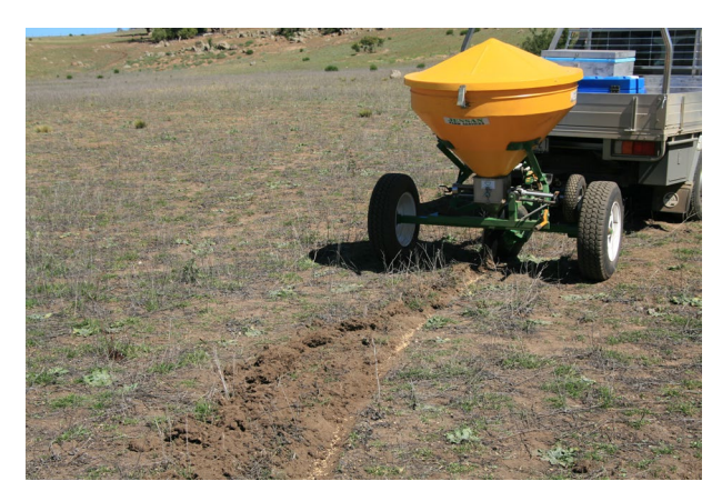
Trail baiting with a bait layer.

If you're planning to use chemicals to treat rabbits, all applicable requirements of the Agricultural and Veterinary Chemicals (Control of Use) Act 1992 and Agricultural and Veterinary Chemicals (Control of Use) Regulations 2007 must be met. This includes following the directions for use on the chemical label, keeping the relevant chemical use records and only using restricted-use chemicals if you hold the required Agricultural Chemical User Permit (ACUP) or other relevant permit. Chemical use record sheets and further information regarding agricultural chemical use can be found on the Ag Vic Agricultural Chemical Use page.