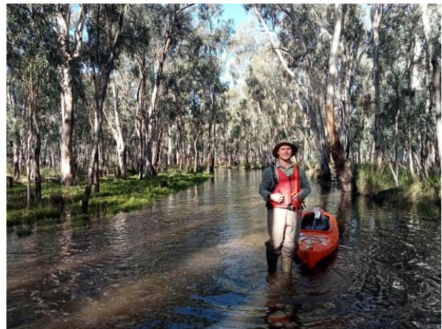
Monitoring the Gunbower Forest floodplain, July 2023

This is one of the scenarios we plan for, and we’ve been adapting water for the environment deliveries to complement these natural inflows. Water for the environment primed parts of the forest and the wetlands, with inflows provided from early June to early July, which is when natural inflows would have begun without river regulation.