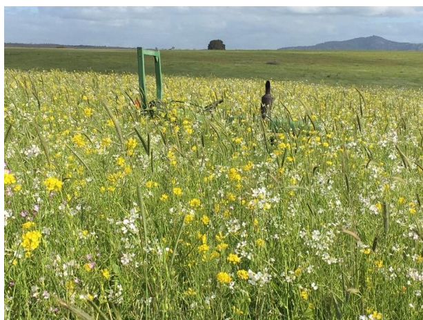
Multi-species cover crop at Talbot

Multi-species cover crops were a popular choice for farmers when considering a demonstration, especially if they had mixed farming operations and were able to get multiple benefits (grazing and soil health) from the demonstration. Farmers that sowed multi-species cover crop were happy with the results and followed up with another cover crop the following year or tried one over summer if the conditions were favourable. We had some good seasonal conditions during this time resulting in cover crops that were too big to manage with grazing.