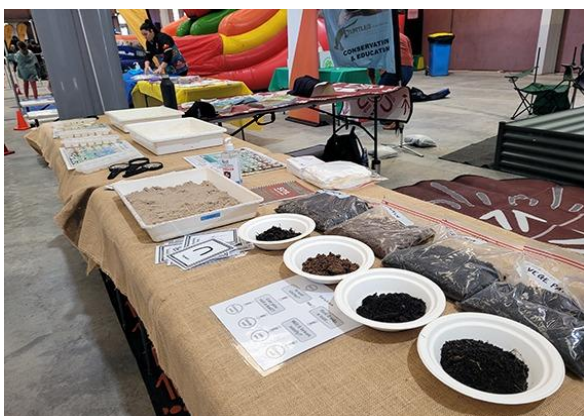
Water bug and soil display

We also had a water bug display which the Citizen Science team collected from the Bendigo Creek earlier that morning, which we use as a health condition indicator of waterways. Our Sustainable Agriculture Team had a display of diverse soils from all over the catchment to show the variability of textures and colours. We also showcased our Native Fish Recovery Plan with fish identification guides, management plans, stickers, and hats.