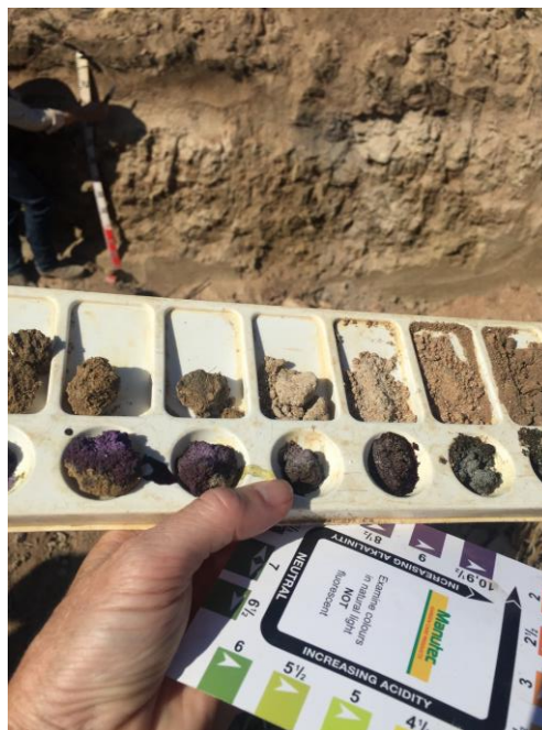
Soil pH testing

The workshops and field days were popular with farmers learning more about soils, pastures, grazing, and biological sprays and fertilisers. The soil pit field days gave the farmers opportunities to learn more about their soils and get their hands dirty. These field days were well received among participants allowing farmers to visualise their soils and any sub-soil constraints and discuss potential solutions or practices to assist in managing these.