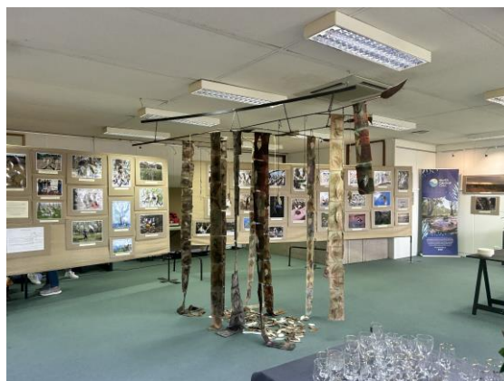
Photo: the exhibition at the Cohuna Art Gallery, North Central CMA

Plan your visit to Cohuna Art Gallery between October and November on Fridays and Saturdays.