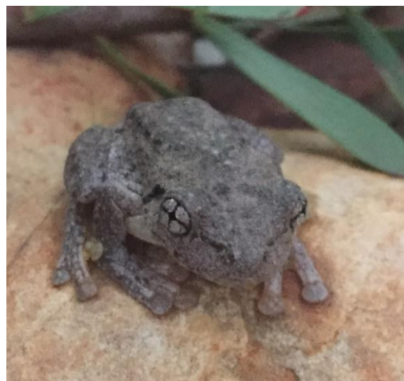
A Peron's tree frog – we often get them on our back veranda when it's wet

Take part in Australia's biggest frog count! Our frogs are under threat from habitat loss, disease, and climate change. Record frog calls with the FrogID App then Australian Museum scientists will listen and identify the calls. This helps provide valuable data for