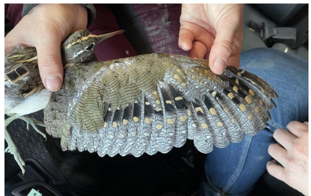
Photo: Gloria, the Australian painted-snipe.

To follow along head to the Painted Snipe Tracking website .