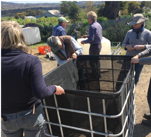
Participants building a Johnson-Si Bioreactor

This product has many uses, it can be mixed into a slurry and used as a seed coating prior to sowing. The product can also be used to make a liquid extract that contain a rich and diverse community of soil microbes, especially fungi. The extract needs straining to remove all the solids before being sprayed onto the paddock or directly into the seed furrow.