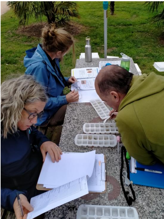
The team busy counting and keying out the waterbugs of Castlemaine's urban waterways on October 4.

Tullaroop Catchment Restoration Project 17 Nov