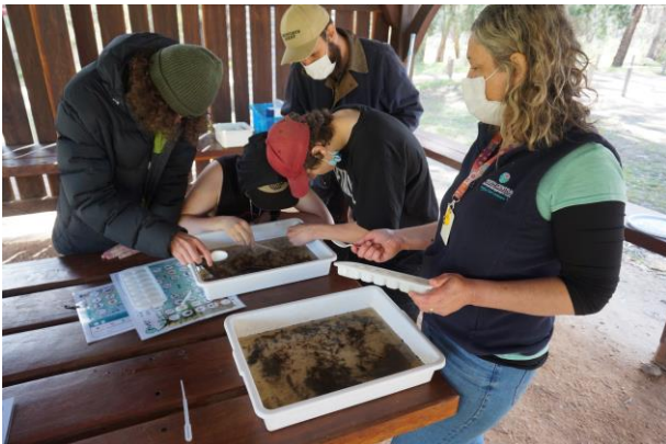
SBATS helping to identify waterbugs from a Bendigo Creek sample

Waterbug monitoring activities are planned over the coming weeks for the Campaspe River, Birch's Creek and our Native Fish Recovery Plan sites along the Gunbower, Loddon and Little Murray Rivers.