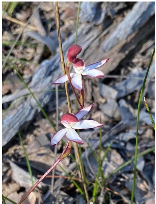
Hooded orchids Kara Kara National Park.

Through our project 'BNG BioBlitz', Buloke and Northern Grampians Landcare Network (BNGLN) has sought to help out our communities through a series of free, small-group, planned activities during spring. Along the way, the Network has connected with many individuals who have not had direct contact with Landcare before, resulting in the attraction of new members for groups such as the recently reactivated Charlton Landcare Group.