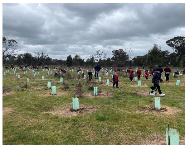
Epsom Primary School planting trees as part of the Northern Bendigo Landcare Group's Victorian Landcare Grant.

During February, I also finalised the reporting for the 2022 Victorian Landcare Grants. It was wonderful to read about the incredible work that has been completed throughout the catchment. Nearly 25 hectares of land was protected through the grants, contributing to those small fragments that are so important. There was also nearly 140 hectares of revegetation completed and 98 hectares of weed control undertaken. An impressive 104 engagement events were delivered to more than 3,000 participants. More than 1,400 volunteers contributed over 10,000 hours to these projects. Congratulations to the grant recipients on completing these works. I'm looking