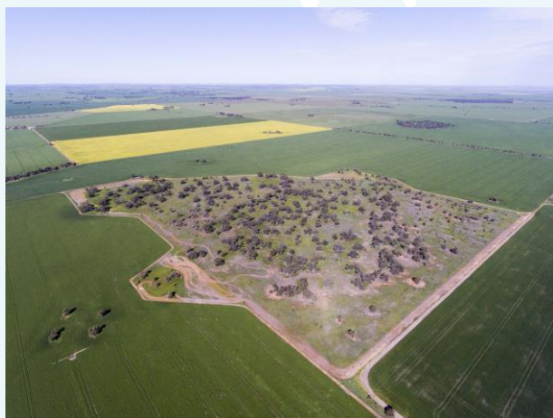
Protected area of threatened buloke and black box woodland in the Birchip area.

To make a submission: go to Inquiry website