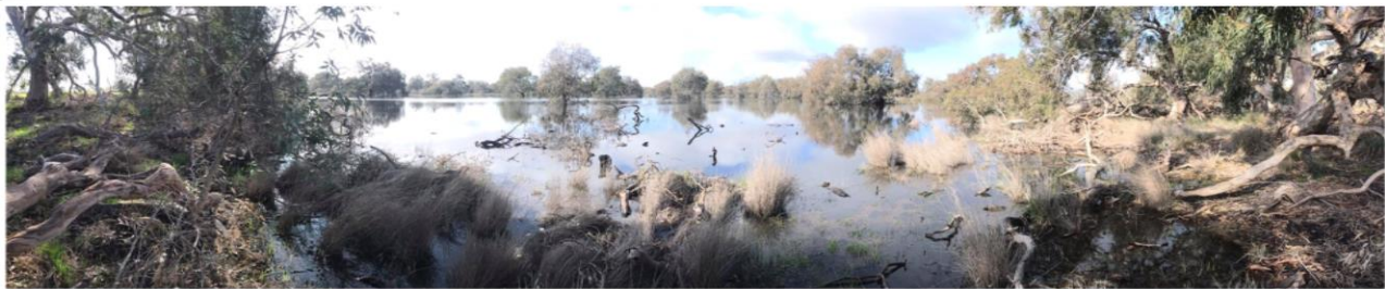
Tang Tang Swamp (near Dingee) is a secret paradise at this time of year.