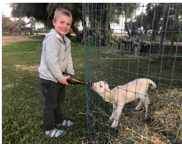
The early bird gets the bottle feed. Jonty and Lenny enjoying one another's company on a chilly winters day.

The current working arrangements have made time available for a lot of planning and prioritisation discussions. Landcare Groups and Networks current priorities, projects and past actions have been the focus of a recent meeting series hosted by North Central CMA and DELWP. Represented by Landcare Network Chairs and Facilitators, the group discussed land, water and biodiversity assets, as part of the Regional Catchment Strategy (RCS) and Biodiversity Responses Planning (BRP) processes.