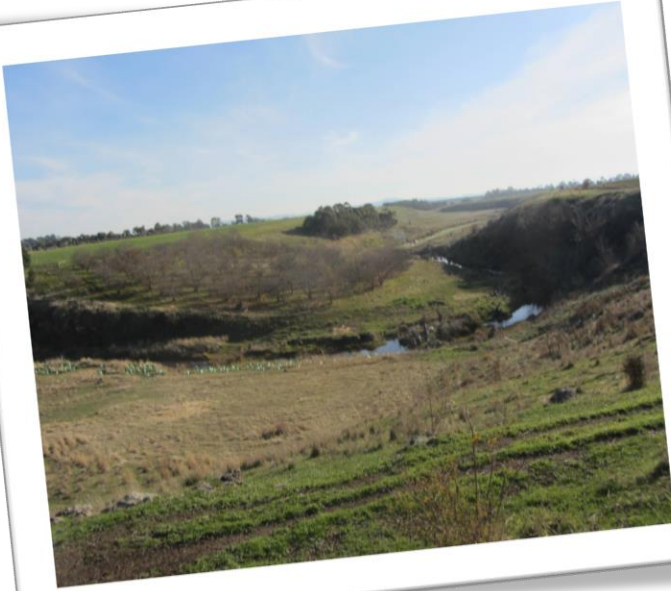
Ullina Landcare Group's Birches Creek revegetation project planted over 1700 tubestock to restore the riparian zone.