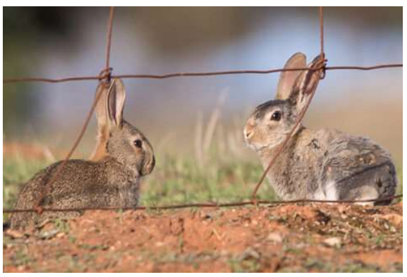
Controlling rabbits and other feral animals at scale can help reduce Australia's greenhouse gas emissions.

Mr Glanznig cited Centre analysis which has previously found controlling rabbits, feral goats and camels at scale has the potential to make a significant contribution to emission-reduction targets: by reducing the impact of feral herbivores on native vegetation — our native grasses, shrubs and young trees — can act as a more effective carbon sink.