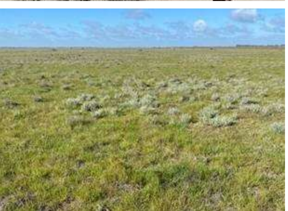
Photo points of changes in ground cover and plant structure at the Bear's property (Above: 2008. Below: 2021)

The future management by the next generation is a current focus for Greg and Jo. They have been investigating potential projects such as carbon sequestration and natural capital accounting, which will provide benefits to the property and the next generation of farmers.