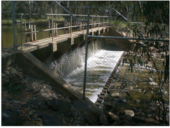
Figure 4: Quambatook Weir, built in 1976 by the Avoca River Improvement Trust became an asset of the North Central CMA when it was formed on 1 July 1997.