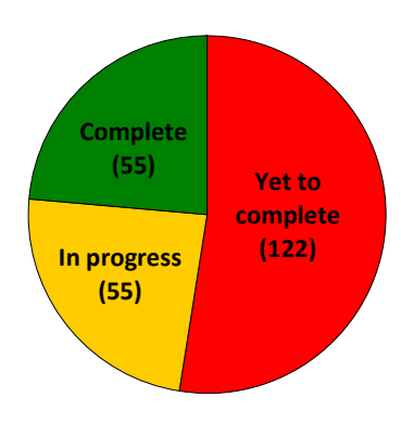
Figure 2: Progress with 232 fencing repair projects

• Landholders have welcomed this assistance: