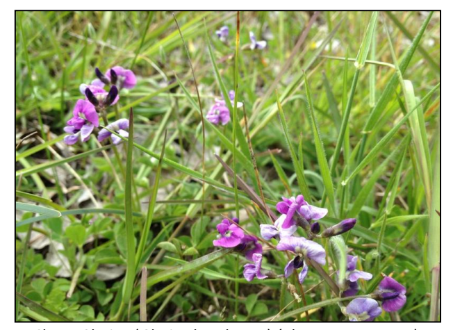
Clover Glycine (Glycine latrobeana)

The project area is known to contain one nationally (EPBC Act) listed fauna species; the vulnerable Growling Grass Frog (Litoria raniformis). In addition 14 State threatened species have been recorded within the project area.