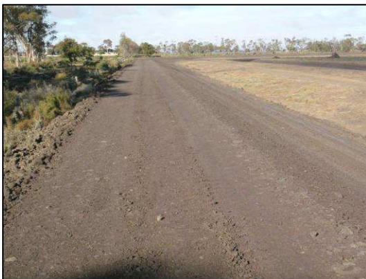
Figure 7: Repaired Lake Boga floodway (June 2012)