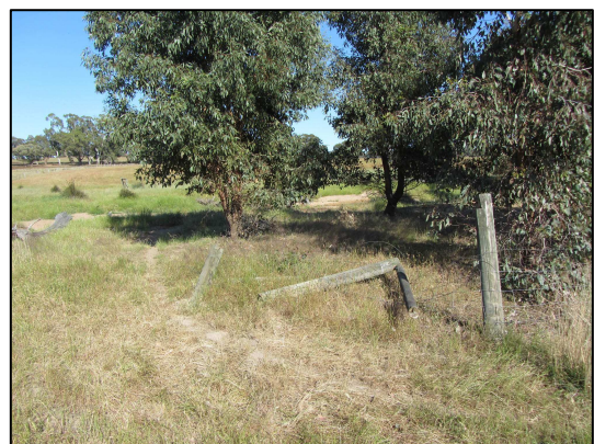
Figure 2: Flood damaged fencing, Shelbourne