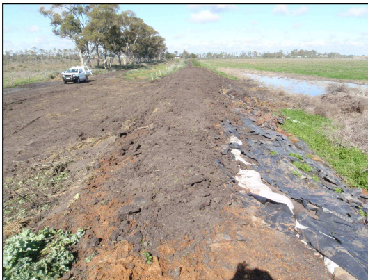
Figure 6: Lake Boga floodway requiring repair post floods (August 2011)