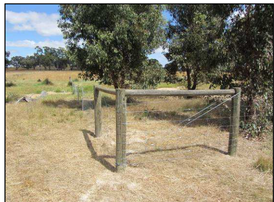
Figure 3: Replaced fencing (after works)