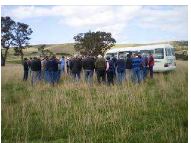
PPS members inspecting a long established phalaris pasture during the PPS Conference Day in September 2011.

PPS members are heavily involved in prime lamb and mutton production. PPS also has 30 members involved in agribusiness and agronomic services and one associate group member - the Yarram Landcare Pasture Group, which has 16 farms involved.