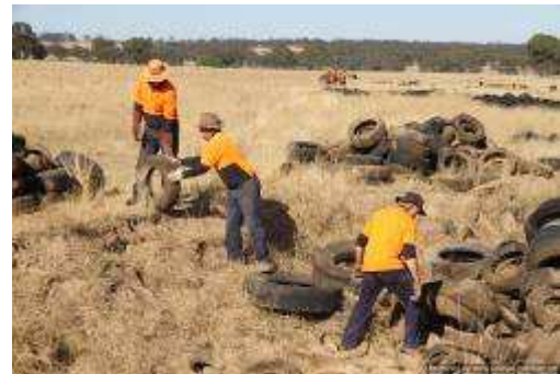
Members of the FREP crew clearing the gully of tyres.

More than 30 people currently employed through the North Central CMA's Flood Recovery Employment Program (FREP) have removed over 100,000 tyres from a gully at Rheola. The tyres were originally put in place to stabilise the eroding gully.