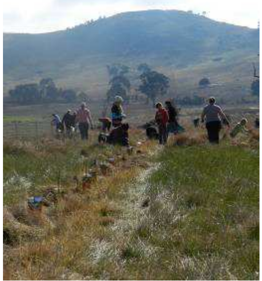
Sutton Grange and Axe Creek 2011 National Tree Day planting

The Organic Soil Guide (<a href="www.organicsoilguide.com">www.organicsoilguide.com</a>) is an online resource for people interested in growing their own fruit and vegies in the backyard. The website provides individuals with a working knowledge of the soil; how to create the optimal soil conditions for the types of plants grown; and how to apply the right management technique to correct any issues with soil condition.