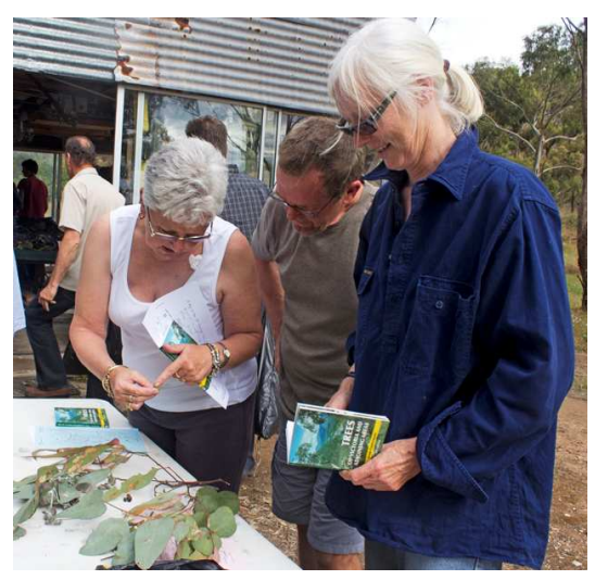
Participants put their identification skills to the test. Photo courtesy of Connecting Country.

How long have eucalypts been in Australia and are they unique to this continent? These were some of the questions answered in Connecting Country's first Eucalypt ID Workshop held at Ian Grenda's property in Maldon on 6 November.