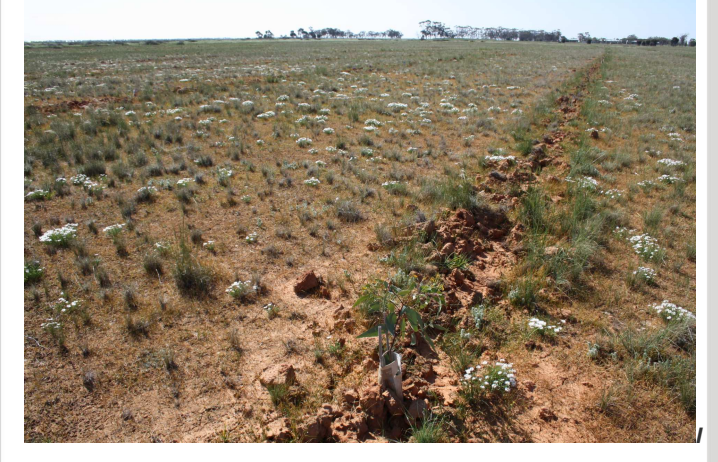
Inappropriate tree planting at Towaninny South Flora Reserve.

Even if tree planting may not significantly damage grassland remnants, site preparation may have major impacts. Disturbance such as cultivation, deep ripping and weed control results in habitat destruction, damage to the soil crust, weed invasion and soil erosion that can be expensive or even impossible to repair.