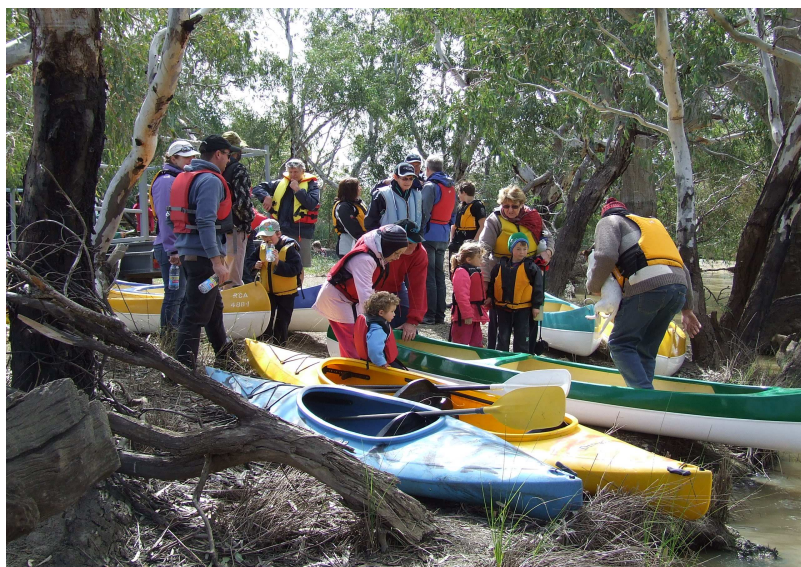
Getting ready to canoe at Serpentine Creek during the Naturally Loddon festival.