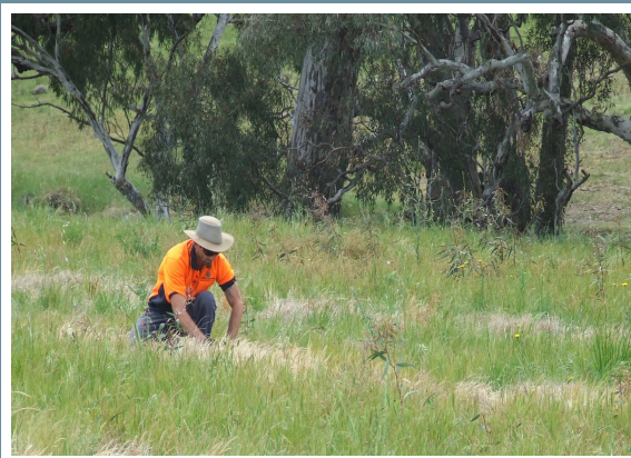
Revegetation work along Tullaroop Creek.

The benefits of the Natural Disaster Relief Recovery Arrangements (NDRRA) funding to the region are significant. The North Central CMA will now be able to repair flood damaged works on properties where we have previously partnered with landholders and there will be ongoing protection of important environmental assets.