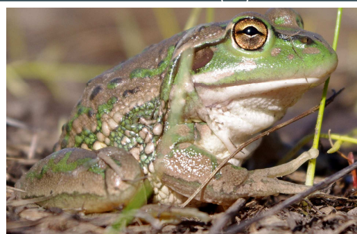
Growling Grass Frog.

If you would like a copy of the poster series, contact Tess Grieves on (03) 5448 7124.