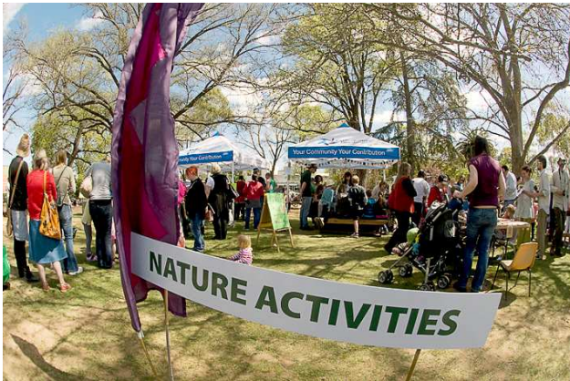
The many stalls at the Family Fun Nature Day.

Connecting Country would like to thank Victoria Naturally, Trust for Nature, the Norman Wettenhall Foundation, bankmecu, IGA, Bakers Delight and KR Castlemaine for helping to sponsor the event as well as the many volunteers who helped to make the day such a success.