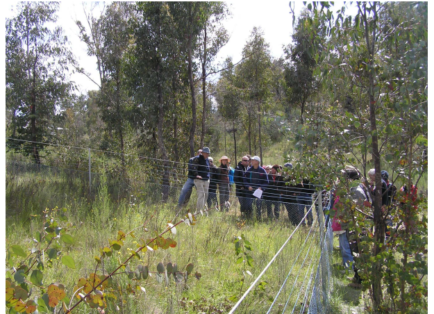
The group looking at the exclusion fencing.

One thing that amazed the visitors was the extent of the regeneration since the fire, especially in the parts of the property that burnt at a lower temperature. In the hottest parts of the fire, some indigenous plants have not returned whereas in other areas, regrowth has been prolific.