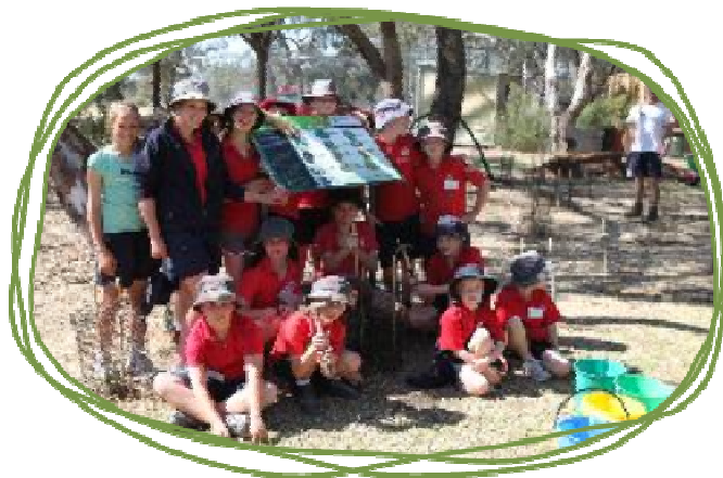
The kids from Gunbower Primary School.

The Gunbower Forest is listed under Ramsar as a Wetland of International Significance. This includes the Gunbower Forest, the Gunbower Creek and associated water bodies.