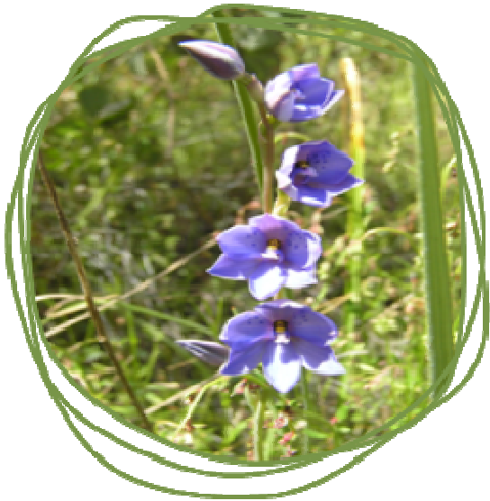
Dotted Sun Orchid.

Another very rare orchid, the Crimson Spider Orchid ( Caladenia clavescens ), has been found on the property. This orchid is only found in a few locations and only in the goldfields area. A fenced exclusion area protects the orchid – the only one ever to be found in this part of the goldfields. Unfortunately, it doesn't appear every year and hasn't since the fire; we are hopeful it will appear this spring.