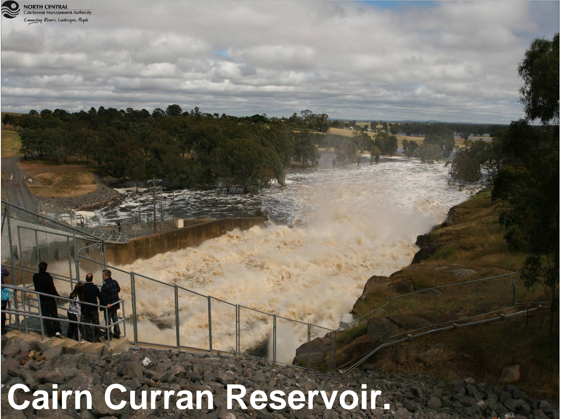
Cairn Curran Reservoir.

NORTH CENTRAL Catchment Management Authority Connecting Rivers, Landscapes, People