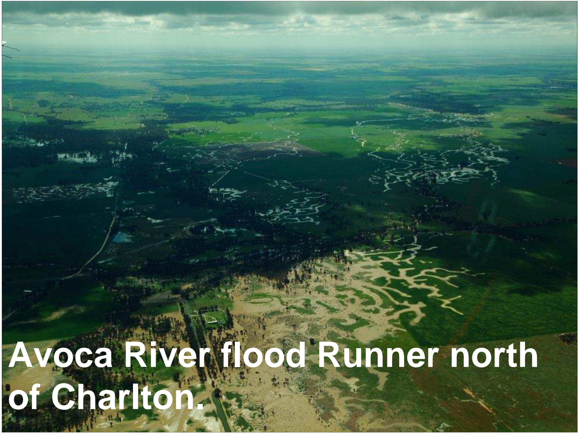
Avoca River flood Runner north of Charlton.