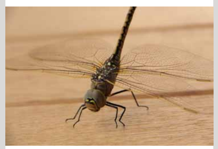
Tiger Dragonfly.

Dragonflies are excellent hunters due to their fantastic flying abilities and well-developed eyes. Some people find them intimidating because of their size and the fact that they can fly at top speeds. But there is no need to fear them as they are harmless. In fact they do us a favour by eating the insects that bite us.