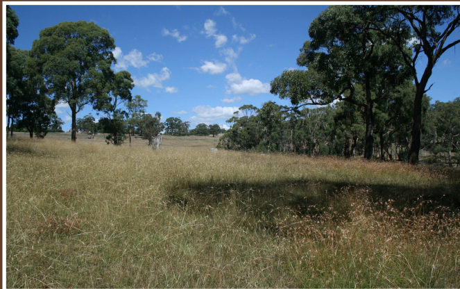
Box-Gum Grassy Woodlands remnant vegetation at Glenlyon