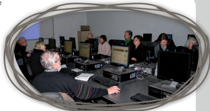
Landcare Gateway Training