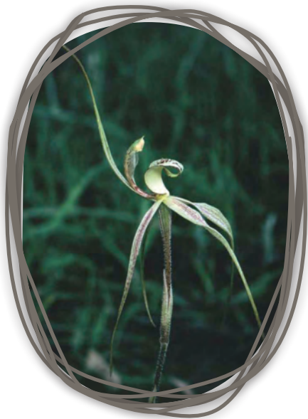
Mclvor Spider Orchid