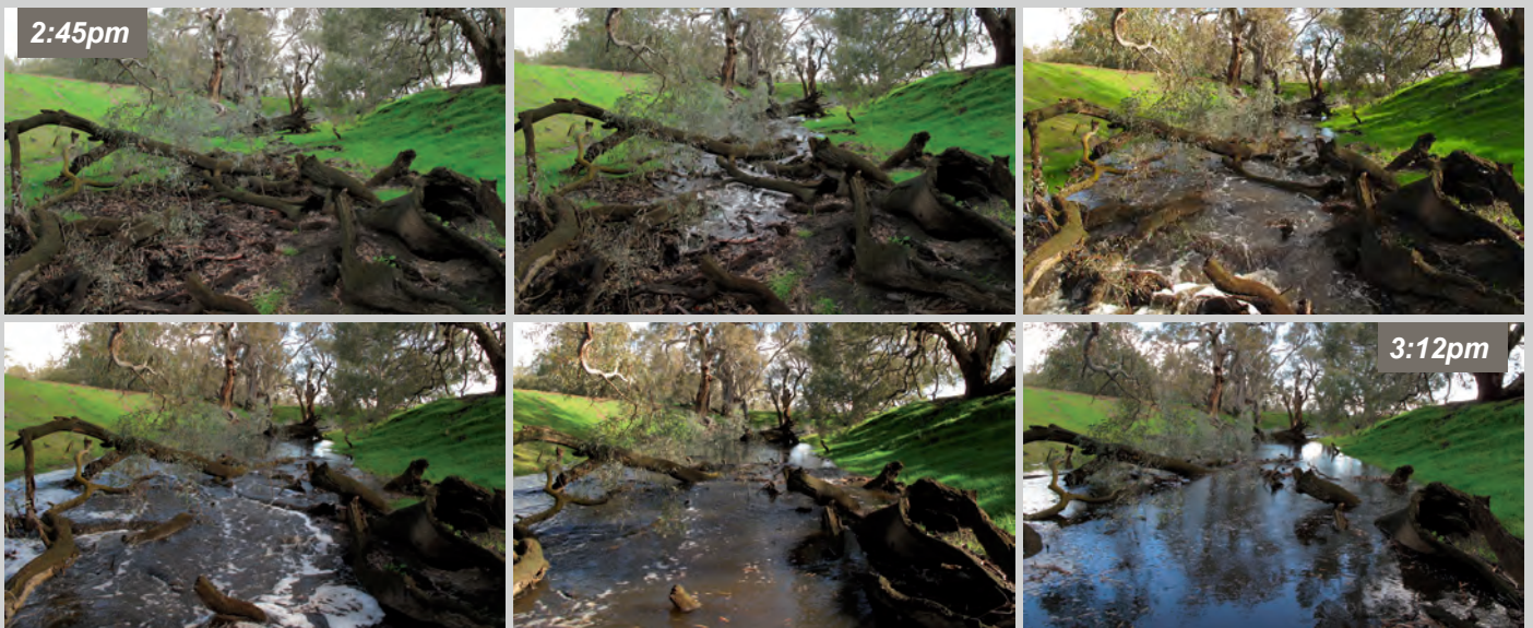
Above: Loddon River 15 Aug 2010 (2:45pm - 3:12pm) between Boort - Durham Ox Road and Canary Island - Leaghur Road)

As the graph indicates, we are getting very close to a record wet year. This is quite remarkable given the lack of rainfall over the past 14 years. Phil Dyson notes that it is very interesting that this change in climate is occurring so rapidly, in the same way that arid conditions began in 1996. It would seem we still have a lot to learn about the things that control annual and seasonal rainfall in SE Australia.