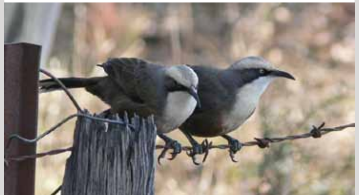
Grey Crowned Babbler