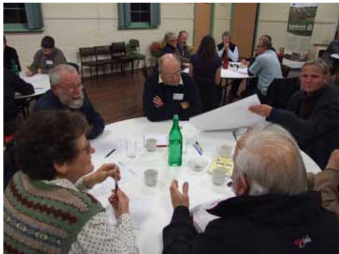
Landcare community consultation underway in Axedale, June 2009.