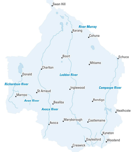
Figure 1: Map of North Central CMA region

The North Central Catchment Management Authority (CMA) is preparing a regional invasive plants and animals strategy to replace previous regional weed and rabbit action plans. The purpose is to provide priorities and goals for weed and vertebrate pest management in the North Central region across all land tenures. More specific actions may be adopted in property management plans or local natural resource management plans. As well as providing guidance on priority actions, the strategy aims to develop an understanding by all land managers of their responsibilities in pest plant and animal management.