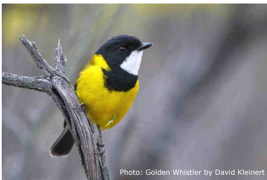
Photo: Golden Whistler

Please wear sturdy shoes, bring your camera, a hat, sunscreen and a smile!