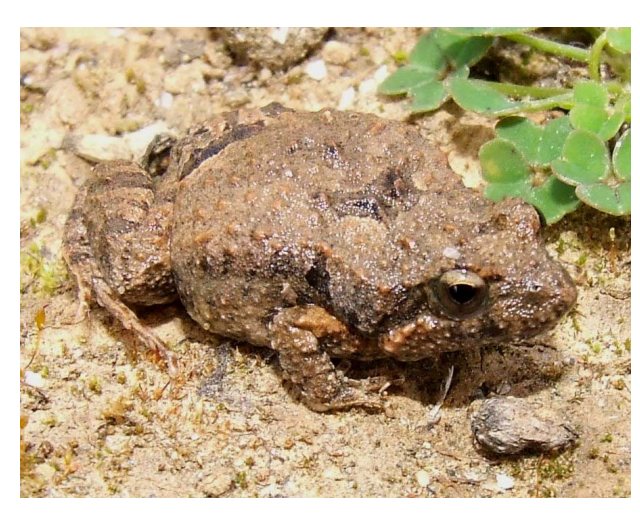
Dorsal view

spine with longitudinal grey and brown stripes, and dark sides with lightly coloured back and incomplete darker stripes. The skin may be either smooth with some irregular warts or the longitudinal skin folds may be raised. The fingers and toes of this species have no webbing.