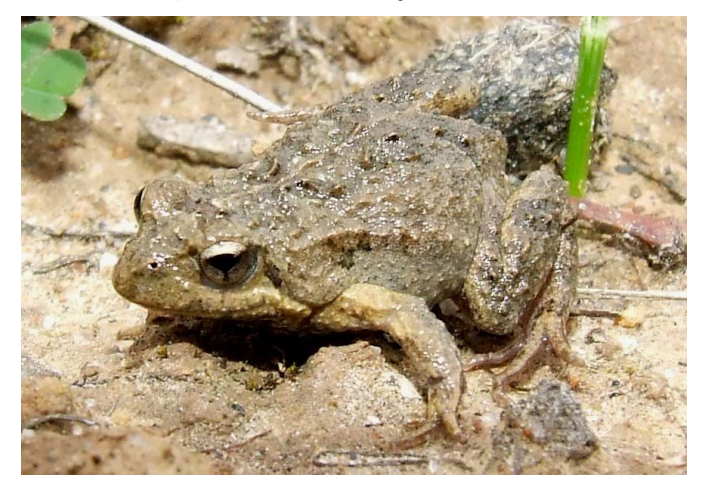
Dorsal view

Crinia parinsignifera like all frogs from the genus Crinia are small, with an average length of about 20mm. They have a grey and granular belly with dorsal colours varying from brown, grey to almost black. These colours make up a variety of patterns covering their back. Such patterns include; light colouring with darker longitudinal stripes, grey to brown with variable dark patches, darkly coloured down the