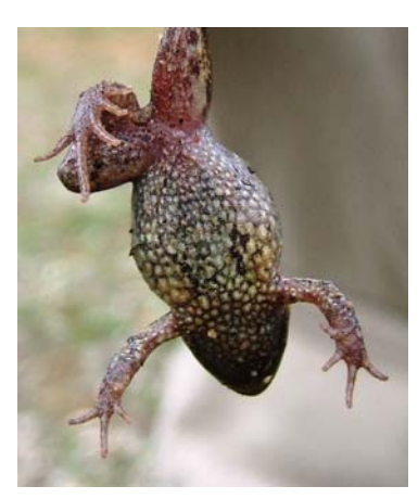
Crinia parinsignifera

The Plains Froglet is considered to be common throughout Victoria. Populations of this species are considered steady and productive. Possible threats to the Plains Froglet include: salinisation, habitat degradation and loss due to urbanization. Loss of temporary pools and soaks due to drought is another possible threat to this species. Presently there seems to be no major threat effecting their population size and this species is actually quite dominant in disturbed areas.