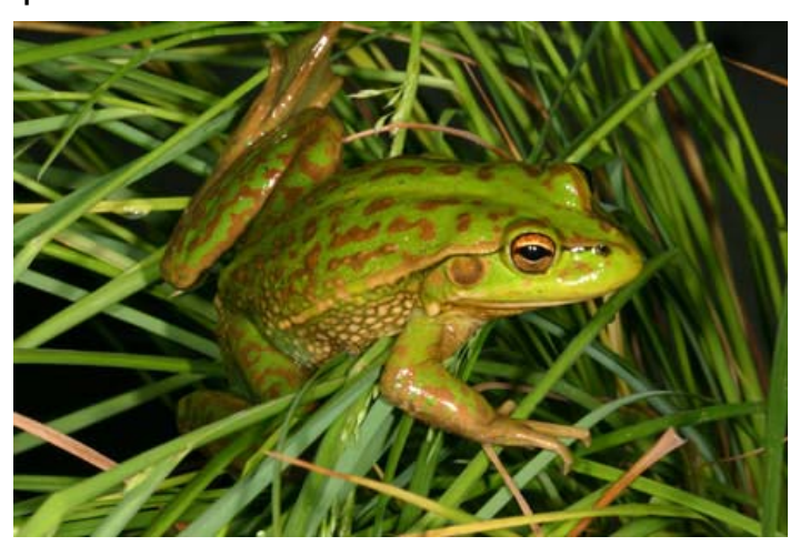
Dorsal view

Colouration of the Growling Grass Frog ranges from brown, dull olive to bright emerald green on its back, with brown, golden, black or bronze spots or lines. Large warts, skin folds and tubercules (lumps) cover the back. Down the spine a pale stripe can be seen, while a dark streak runs from the snout, over the eye and tympanum (membrane covering the ear entrance). Above this a skin fold of pale cream runs down towards the