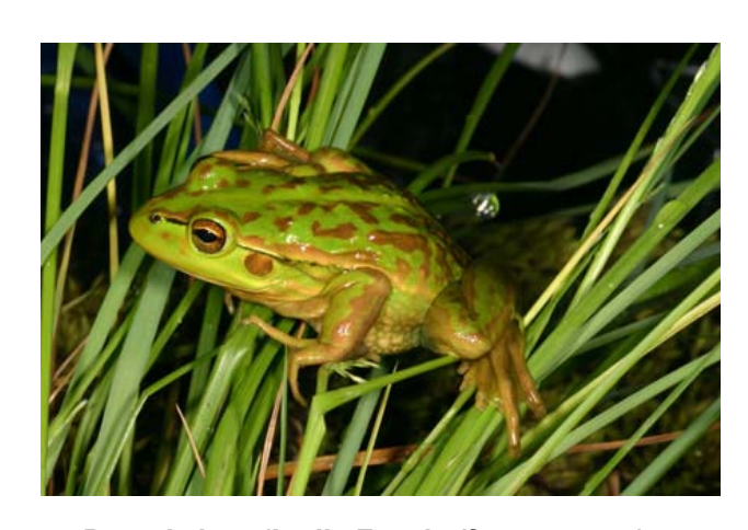
Dorsal view

white, granular belly, and almost fully webbed toes. This species can reach between 55 and 100mm in length.