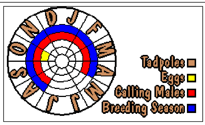
Life History Cycle

Breeding usually occurs during the spring and summer months. Females are believed to become reproductively mature between 2 and 3 years of age.