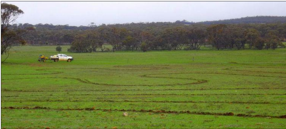
Direct seeding in progress.