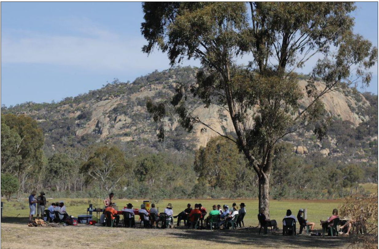
Resting after a community bushwalk.