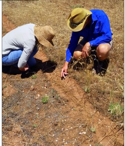
Staff inspect seedlings.