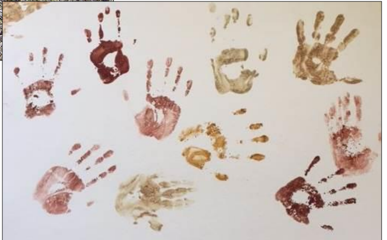
Ochre handprints on paper – Wedderburn College cultural day.