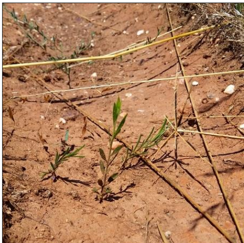
Seedlings emerging.