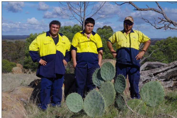
Dja Dja Wurrung Enterprises Works Crew with wheel cactus on Mt Egbert.