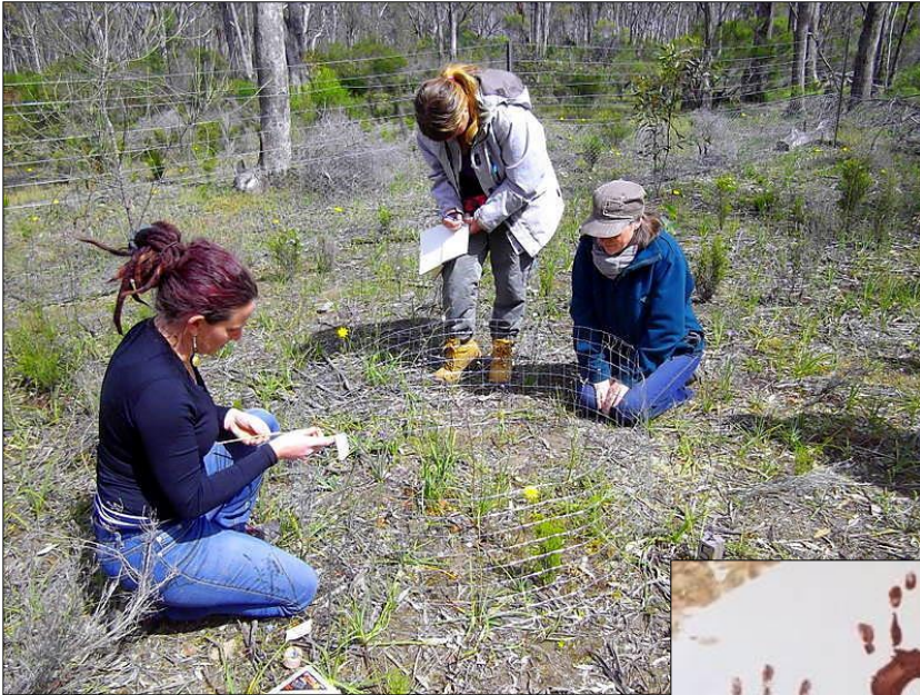
Yellow-lip Spider Orchid monitoring.