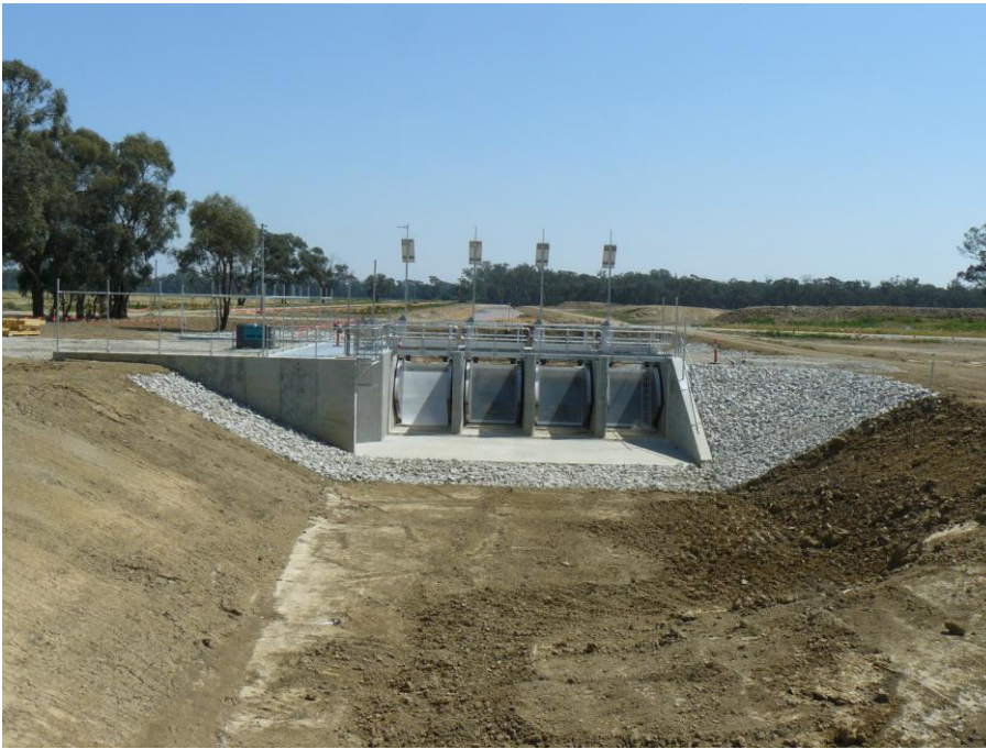
Photo 2: Offtake regulator with gates, walkway and fish lock completed