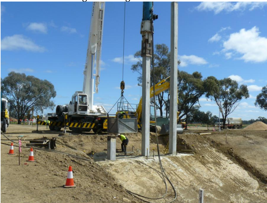
Photo 4: Crane driving piles for new Island Road bridge.