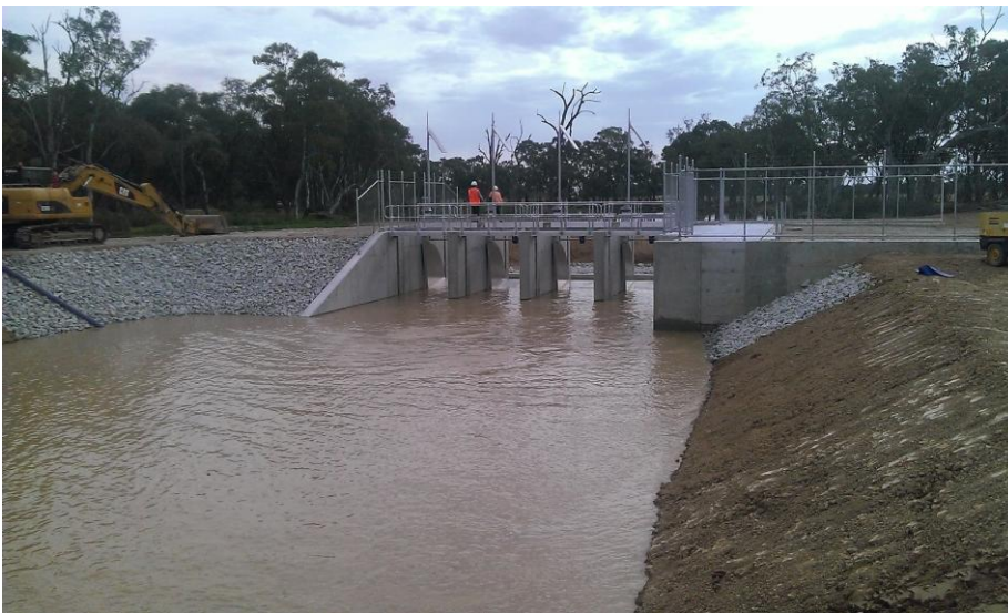
Photo3: Water being let through the new Weir in Gunbower Creek