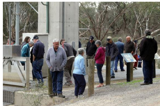
Fish Migration Day tour members visit the Kerang Weir fishway.

“A key part of the Native Fish Recovery Plan is to connect more than 200km of stream and wetland habitats by constructing fishways that allow fish to freely move past barriers such as weirs,” Peter said.