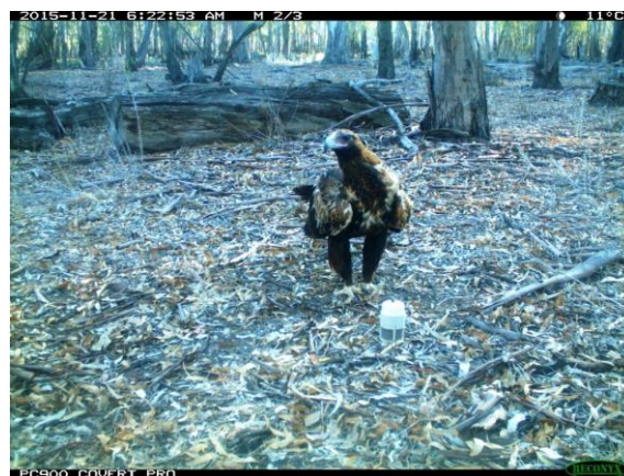
A wedge-tail eagle recorded by automated cameras.

The pilot survey will provide a baseline for future similar surveys of Gunbower Forest and will help to identify differences in the fauna between areas of the forest that have experienced different levels of flooding or environmental watering over the last decade.