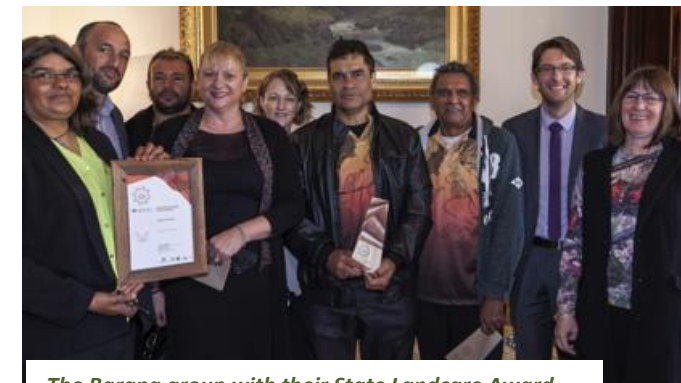
The Barapa group with their State Landcare Award.

The Barapa Water for Country Project has identified, mapped and recorded the cultural values of Gunbower Forest. This information can be used by North Central CMA and Barapa to ensure the rich cultural and spiritual values of the Forest can be represented in environmental watering plans. To read more and to vote for Barapa in the People’s Choice award, please visit http://www.nationallandcareconference.org.au/awards/