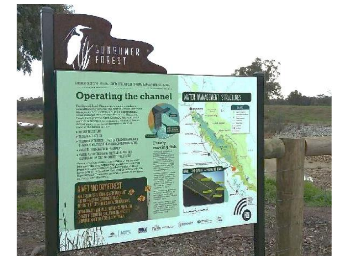
One of the new signs in Gunbower Forest at Hipwell Road.

The signage forms a trail from the entrance to the forest at Cohuna to the environmental infrastructure at Hipwell Road. The signage design features interactive components, including QR codes to scan with your mobile phone to access more information.