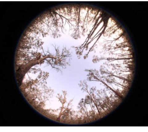
Hemispherical photo of Gunbower Forest, used to monitor tree health.

"Red gum canopies are obviously healthier in areas that have been flooded, naturally and with environmental water, than in dry areas of the forest," Kate said.