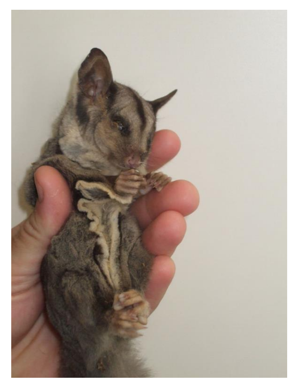
Found at the feet of a pet cat: a deceased sugar glider.

Cat owners are also urged to consider desexing their cats to prevent them reproducing and adding to the increasing population of unrestricted cats across the landscape.