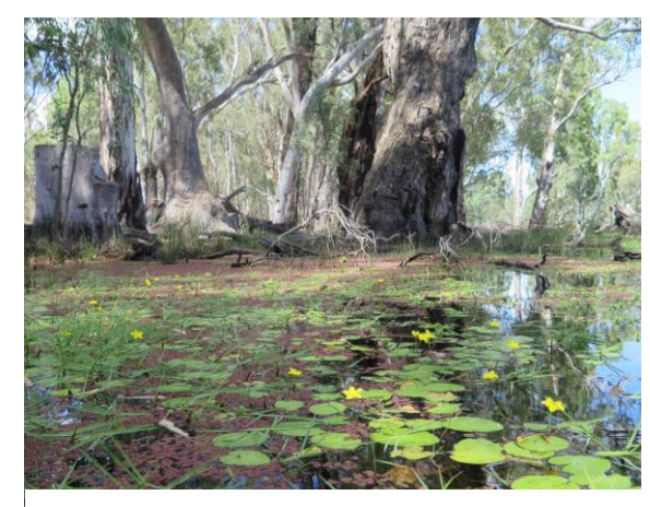
Reedy Lagoon after spring 2015 watering.

"Large areas of the forest flourished in spring 2015. The forest floor was luminescent with wavy marshwort, milfoils, rushes, water ribbons, swamp lily and sedges. The environmental water ensured there was aquatic habitat on the dry floodplain," Kate said.