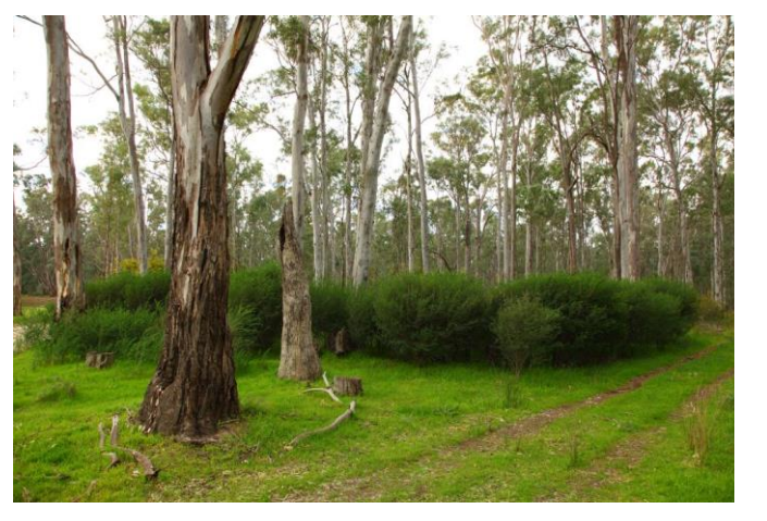
Montpellier broom along River Track in Gunbwoer Forest

Within the forest, towards the Koondrook end, small infestations of athel pine, noogoora burr and ivy-leaf sida have also been treated to control their spread.