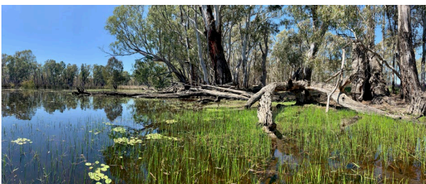
Reedy Lagoon will be a haven for nature lovers

Our pick is Reedy Lagoon. It's a great spot for waterbird watching, photography and has beautiful old red gums and lots of wetland plants. Yarran Creek and Little Gunbower Creek are also great options for kayaking. The forest will be at its best in late spring as water plants start to flower, birds and frogs are breeding making it the perfect place to explore when the weather finally warms-up.