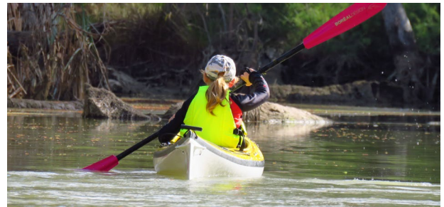
Kayaking along Gunbower Creek