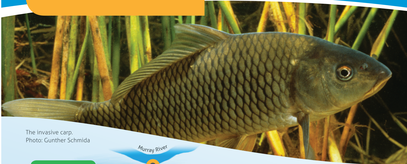
The invasive carp.

Sunday 20 October 2019 National Gone Fishing Day 12 noon – 3.00pm