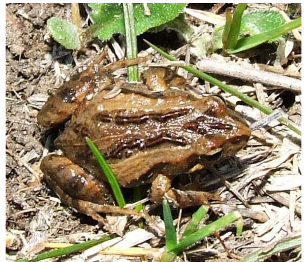
Dorsal View

with scattered flecks of black or gold. The tail has a rounded tip, with gold flecks on lighter coloured tadpoles, but no flecks are seen on the darker variety. These tadpoles are bottom dwellers feeding on microscopic particles of the substrate. They hide under the leaf litter and among rocks where they are well camouflaged.