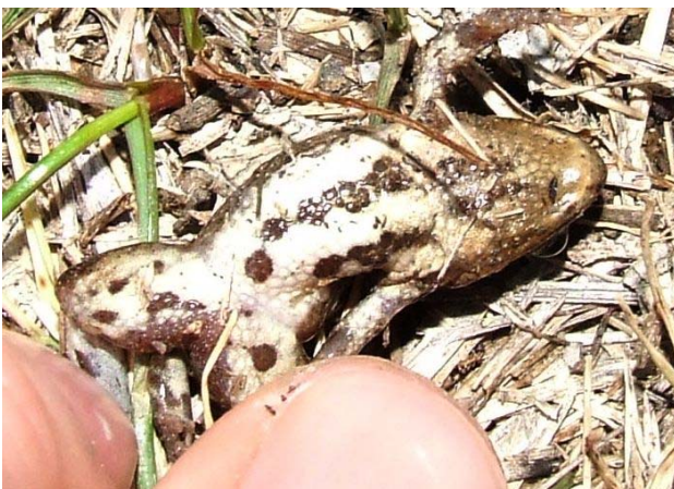
Ventral view - note marbling

The throat and chest of the males is either white, grey (muddy white) or brown. The texture on their back is variable, it can either be smooth with a few warts, have longitudinal ridges, or have boomerang shaped ridges over the shoulder and back. The fingers and toes of the Common Froglet are not webbed.