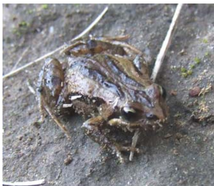
Crinia signifera

The Eastern Froglet is common and very stable throughout Victoria with the possibility of population sizes increasing. Possible threats to the Eastern Froglet include: urbanisation and tourism, loss of temporary pools, and habitat fragmentation. These frogs have a high fecundity rate, laying up to 51-200 eggs/female/year. Throughout Australia, the Common Froglet covers a range of 80,001-1,000,000 km 2 with an estimated total population of >50000 adults.