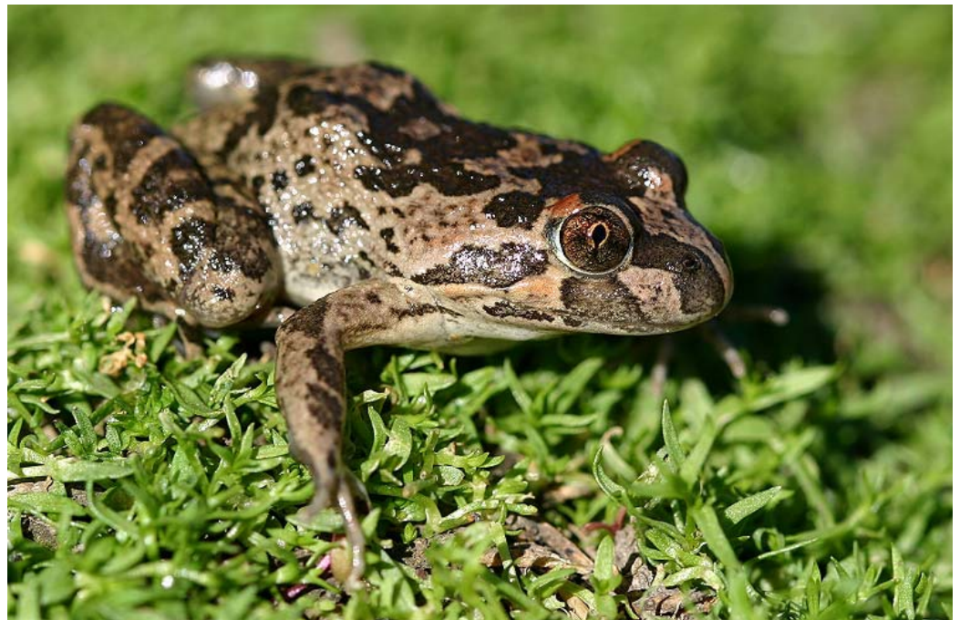
Barking Marsh Frog.

The adult Barking Marsh Frogs are of small to moderate size. They have large irregular edged brownish-olive green blotches on their back, as well as a reddish-orange patch on their upper eyelid. Skin on its back is smooth with low round warts, while the underside is white and smooth. The base of their toes are webbed. Adults are usually between 33 and 55mm in length.