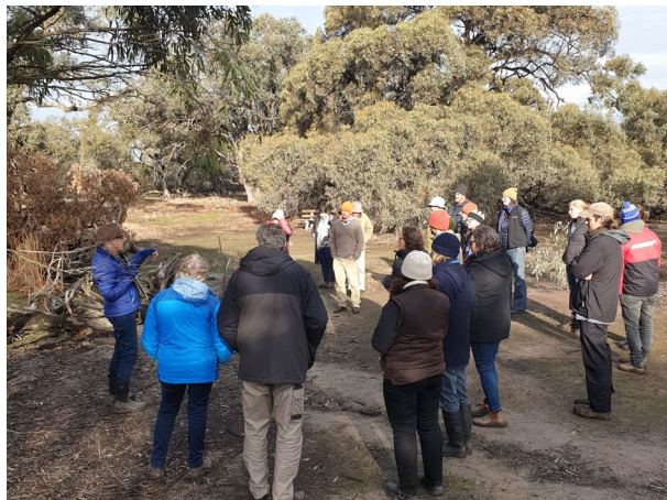
Participants at the McAllister property Bonnie Brae on the Windharp Horizons field trip.

Get started by joining a fungi foray and familiarise yourself with what to look for by checking out the Fungimap website and newsletter.