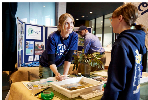
Speaking with students at our stall in the Showcase area

It was humbling to attend the awards to hear from passionate teachers and incredibly knowledgeable and articulate students of all ages speak with such positivity about the environment and the part they play in helping it survive and thrive. I came away inspired and uplifted about the role this future generation will play and very proud to be working in the sustainability education field with our very own River Detectives program.