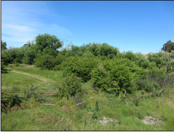
Before willow and hawthorn removal