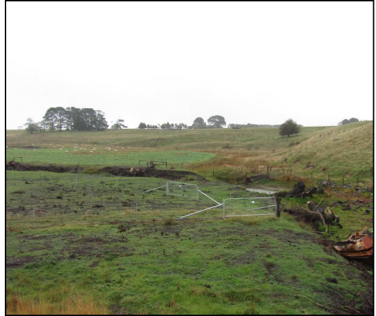
After weed removal and fencing