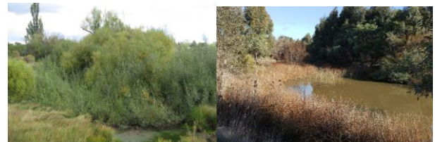
Coliban River Malmsbury - before and after

now the revegetation is well established and a lot of water plants came back by themselves. The waterhole is around two meters deep, and now the site provides great habitat for a lot of species". Chris often sees rakali (water rat) foraging and paddling among the fringing vegetation.