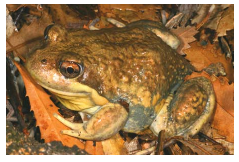
Dorsal view

Limnodynastes dumerili commonly know as the Eastern Banjo Frog or Pobblebonk, is a dark coloured frog ranging from colours of grey, dark green, dark brown to black. The skin is rough and warty on the back and smooth white or mottled underneath on the belly. On the face of the frog there is a pale stripe which runs from underneath the eye to the arm . Above this stripe is a black band which reaches from the eye to the tympanum