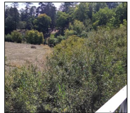
Willow infestation and uncontrolled cattle access opposite the Kyneton Botanic Gardens, March 2016

Since 2013, the project has worked collaboratively with the Group to remove willows and revegetate the riverbanks along the public land.