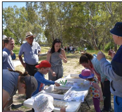
Discovering the river's waterbugs at the Kids by the Campaspe event, November 2016

The broader community is also engaged through project promotion at the Elmore Field Days, Kyneton Agricultural Show, Campaspe Carp Catch and other events.