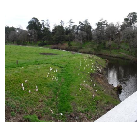
The river at Kyneton after the removal of willows, fencing to exclude cattle and revegetation with native plants, July 2016

The project has also worked with several landholders on the opposite bank to complete the work.