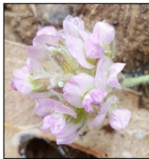
Endangered Small Scurf-pea ( Cullen parvum )

The riparian (streamside) vegetation plays an important role in the health of the river. A diversity of native trees, shrubs and grasses shade (cool) the water, hold the banks together and filter runoff from adjacent farmland. It provides a source of food and shelter for both terrestrial and aquatic fauna, including Murray Cod, Platypus and threatened terrestrial species.