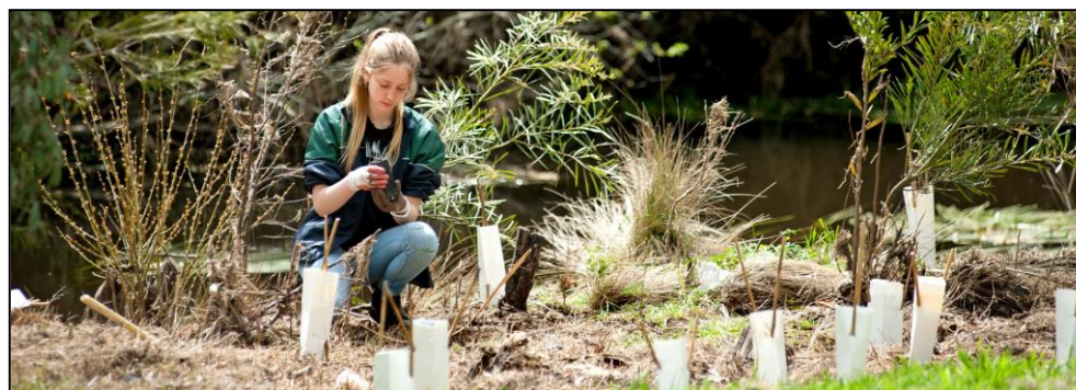
Kyneton Secondary College students replaced willows with native plants, November 2016