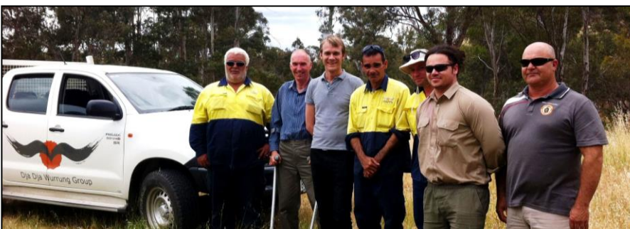
Onground works team members of Dja Dja Wurrung and Yorta Yorta Nations with DELWP representatives at a Project Reference Group meeting, November 2014