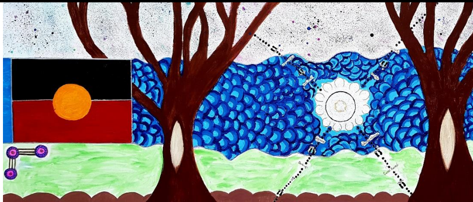
Artwork courtesy Dja Dja Wurrung Aboriginal Youth Cultural Strengthening project