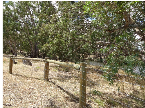
Photo: River fencing on the Bickley property