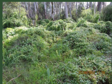
Bridal Creeper infestation in Gunbower Forest

So far this year, the project team has treated around 250 ha of Bridal Creeper along Gunbower Creek and in Gunbower Forest.