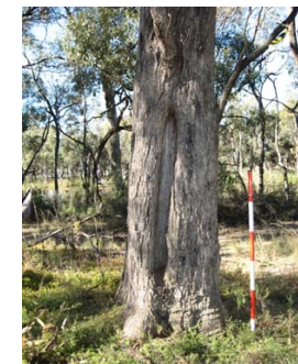
Scar tree recorded during cultural heritage surveys at Hipwell Road