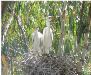
Great egret chicks in Gunbower Forest January 2012