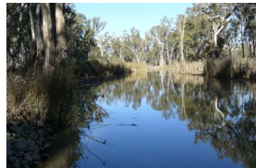
Gunbower Creek below Cohuna Weir, 26 September 2012

A further 5 GL of The Living Murray environmental water has been reserved for use in Gunbower Forest this spring and summer. The water will be used to provide connectivity between Gunbower Creek and the River Murray and to provide top-up flows if required to maintain a bird breeding event.