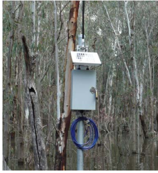
Water Depth logger installed in Little Gunbower Wetland Complex

Funding for the water depth loggers was provided by The Living Murray Initiative.